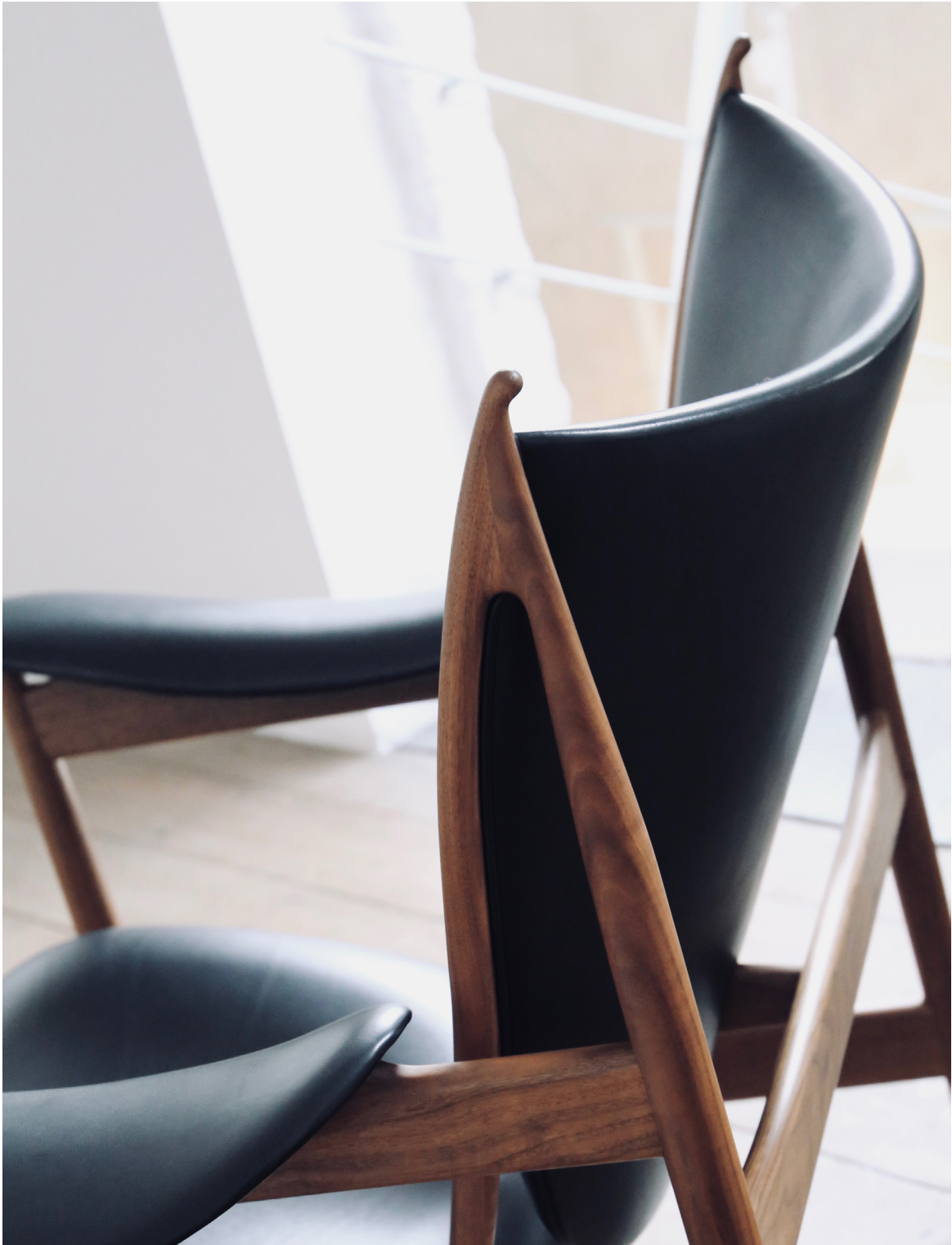
CHIEFTAIN CHAIR 1949 BY FINN JUHL